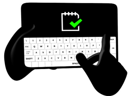
exact file location and relocation