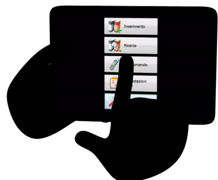
advanced features and settings