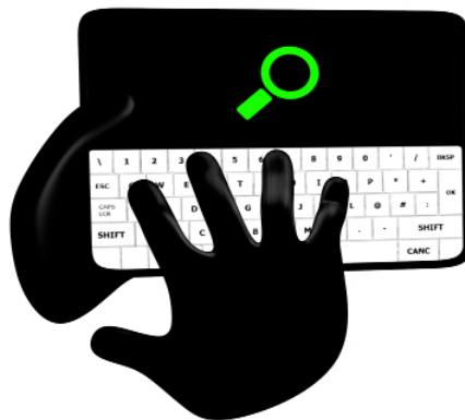
new search criteria

The interface graphics have been designed to be highly intuitive, so that the software is user-friendly, making the shelves organization and the database implementation simple.